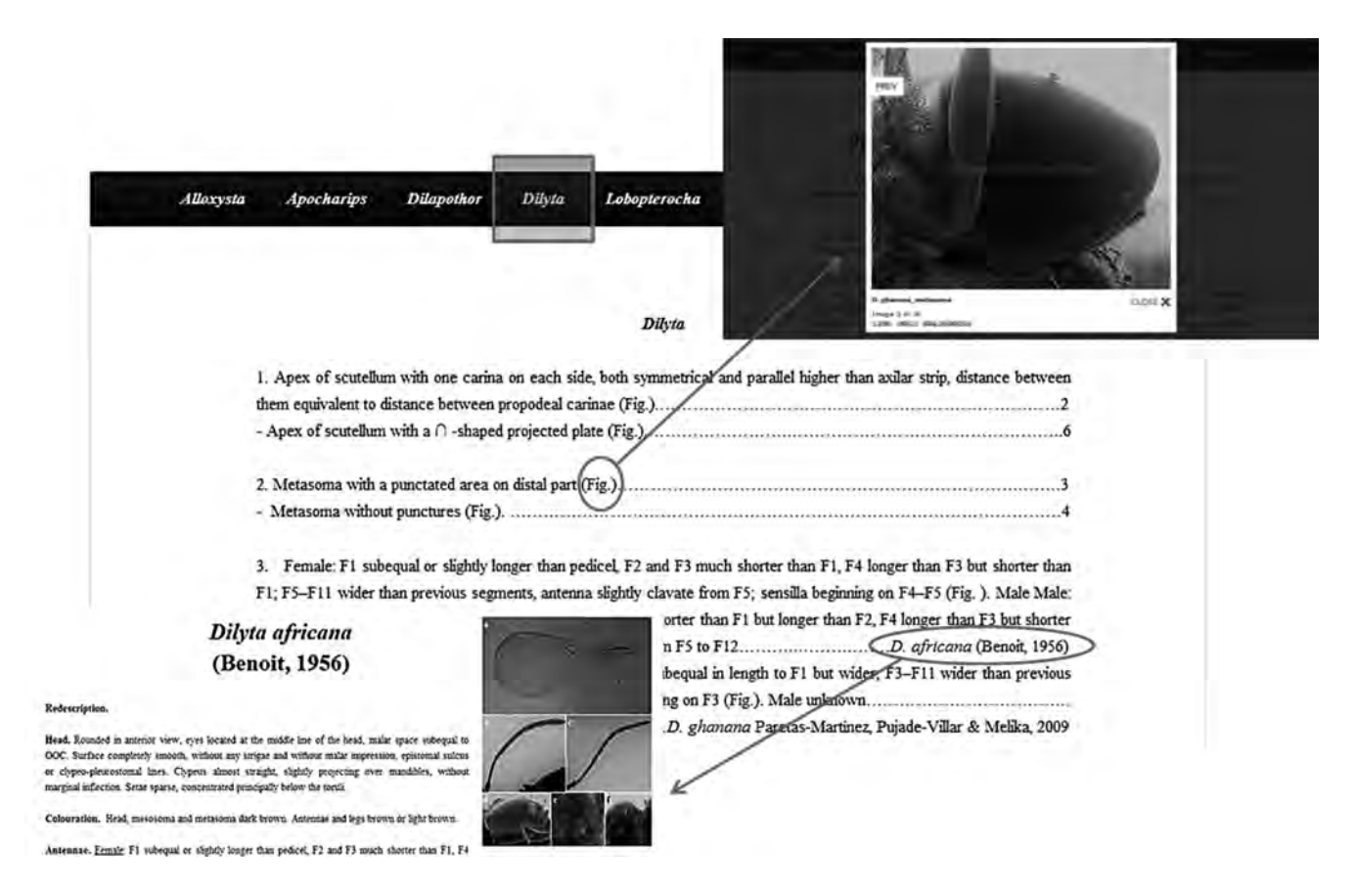
Figure 3. Screenshot of the part of Dylita Specific key within the website, ncluding also the screenshot of the Valid species ( D. africana ) within the website.